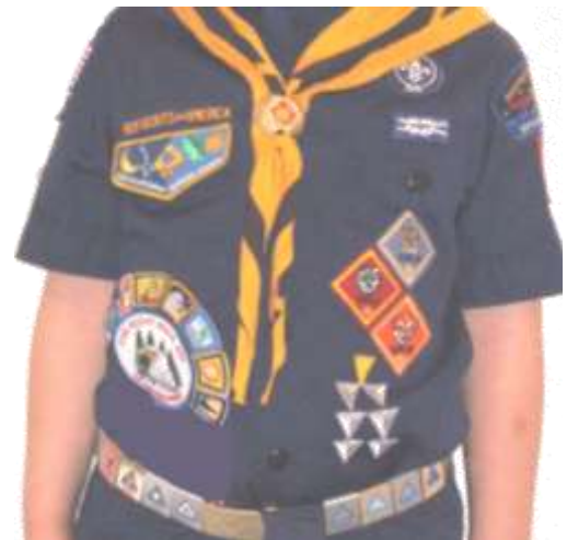
▲ Example of a Pack 455 Wolf Scout uniform after ranking.

Patches and pins not worn on the uniform may be worn on a red felt pride vest (sometimes called a brag vest). There are patterns on the web or they can be purchased for about $14 at a Scout Shop. Although there are not any rules on patch placement on the pride vest, we do recommend the Pack 455 Pride Patch be centered on the back of the vest for segments to circle. An active scout will have a large circle or participation segments. The vest may be worn unless requested otherwise for an official event.